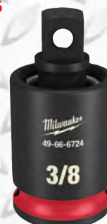
3/8" Drive Universal Joint 49-66-6724 $9.50