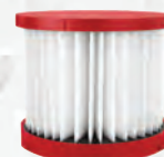
HEPA FILTER 49-90-1900 $25.00