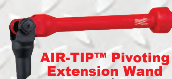
AIR-TIP™ Pivoting Extension Wand 49-90-2031 $16.75