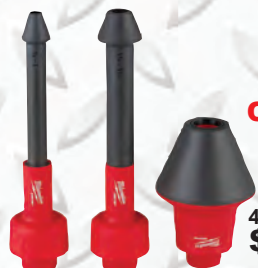
AIR-TIP™ Conduit Line Puller Kit 49-90-2024 $64.00