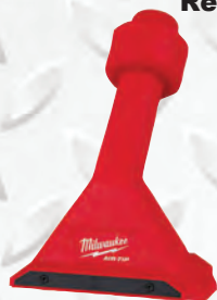
AIR-TIP™ Magnetic Utility Nozzle 49-90-2032 $27.00