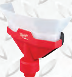
AIR-TIP™ Dust Collector 49-90-2022 $43.00