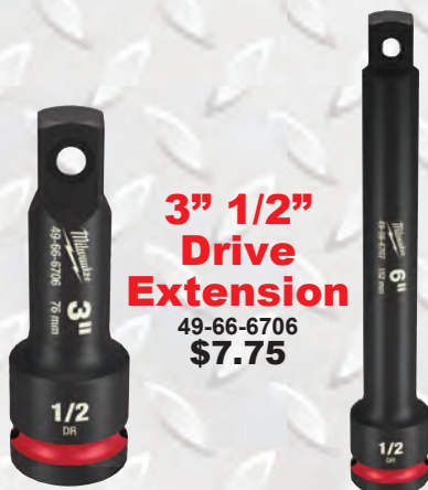
3" 1/2" Drive Extension 49-66-6706 $7.75