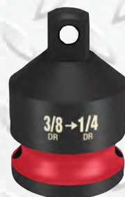
3/8" to 1/4" Drive Reducer 49-66-6722 $5.99