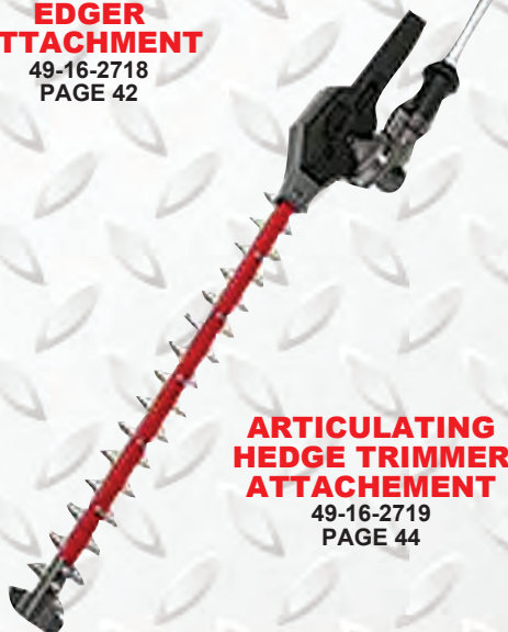
ARTICULATING HEDGE TRIMMER ATTACHMENT 49-16-2719 PAGE 44