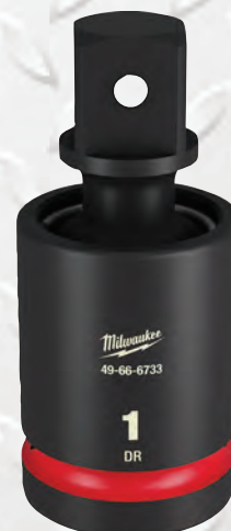
1" Drive Universal Joint 49-66-6733 $59.10