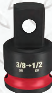
3/8" to 1/2" Drive Adapter 49-66-6723 $8.25