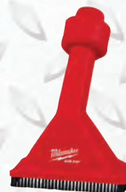
AIR-TIP™ Rocking Utility Nozzle w/ Brushes 49-90-2038 $16.95