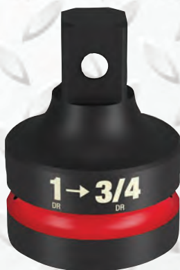
1" to 3/4" Drive Reducer 49-66-6731 $29.75