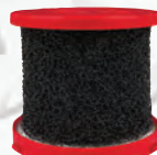
FOAM WET FILTER 49-90-2015 $14.00