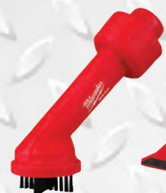
AIR-TIP™ Cross Brush Tool 49-90-2035 $12.00