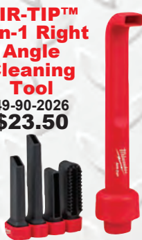
AIR-TIP™ 4-in-1 Right Angle Cleaning Tool 49-90-2026 $23.50