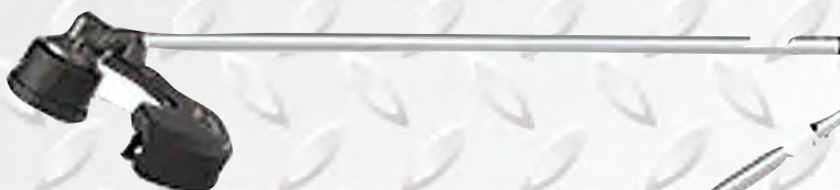
STRING TRIMMER ATTACHMENT 49-16-2717 PAGE 42