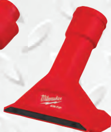
AIR-TIP™ 2-1/2" Magnetic Utility Nozzle 49-90-2033 $32.00