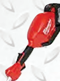
M18 FUEL™ POWER HEAD w/QUIK-LOK™ 2825-21ST, 2825-20ST PAGE 42

The M18 FUEL™ QUIK-LOK™ Attachment System utilizes the most advanced cordless technology to deliver best-in-class and run-time for landscaping and trade professionals, achieving instantaneous throttle response and outperforming higher voltage platforms.