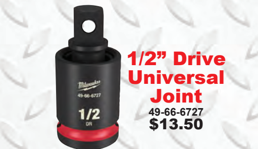
1/2" Drive Universal Joint 49-66-6727 $13.50