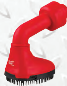
AIR-TIP™ Swiveling Palm Brush 49-90-2020 $29.75