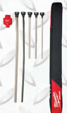
AIR-TIP™ Long Reach Flexible Micro Hose Set 49-90-2037 $35.50