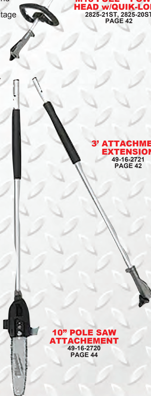
3' ATTACHMENT EXTENSION 49-16-2721 PAGE 42