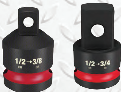
1/2" to 3/8" Drive Reducer 49-66-6725 $6.60