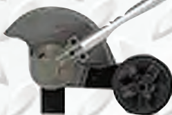
EDGER ATTACHMENT 49-16-2718 PAGE 42