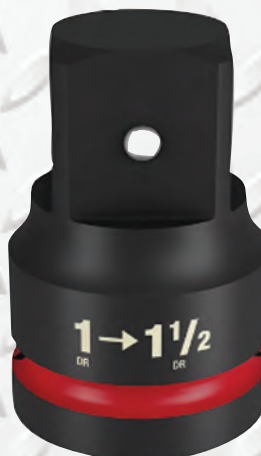
1" to 1-1/2" Drive Adapter 49-66-6732 $52.50