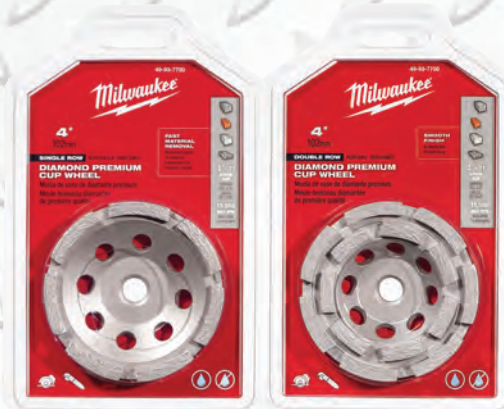
4" Single-Row 49-93-7700 $44.99