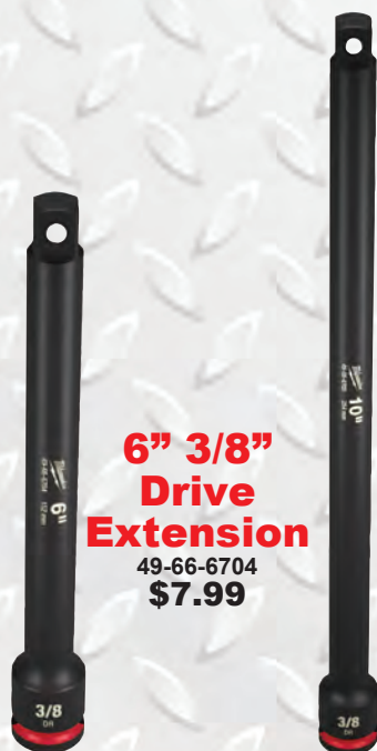
6" 3/8" Drive Extension 49-66-6704 $7.99